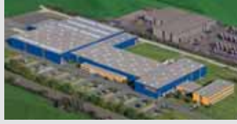
Hörmann KG Antriebstechnik