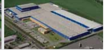
Hörmann KG Ichtershhausen