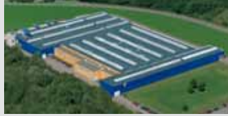
Hörmann KG Eckelhausen