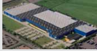
Hörmann KG Brandis