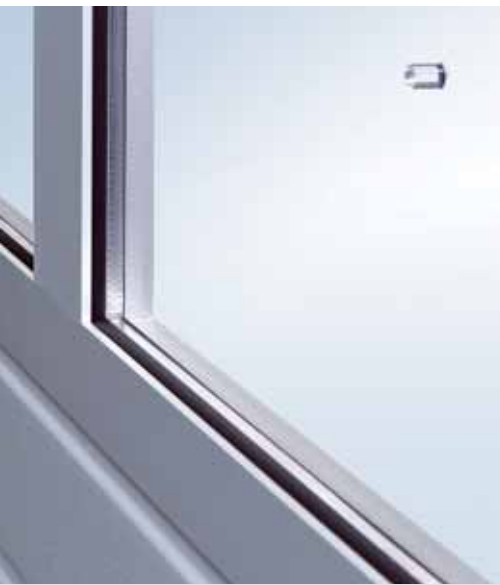
Previous glazing with spacers