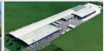
Hörmann LLC, Montgomery IL, USA

Hörmann is the only manufacturer worldwide that offers you a complete range of all major building products from one source.