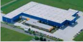
Hörmann KG Dissen