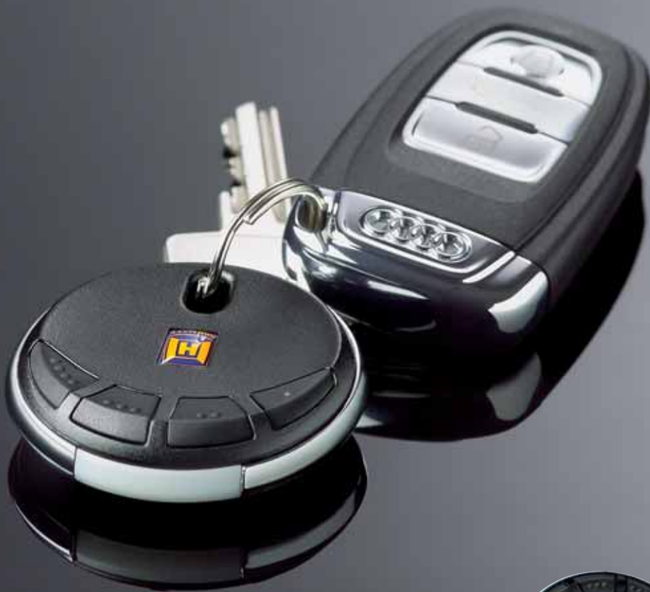
Hand transmitter HSP 4 for up to four functions

The HSP 4 hand transmitter has a new design, promoting both elegance and quality. An additional chrome ring and black buttons contribute to the attractive appearance. The HSP 4 hand transmitter has four functions including signal lockout and a key ring.