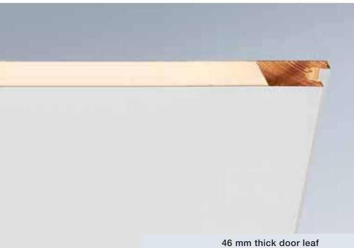
46 mm thick door leaf