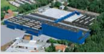
Hörmann KG Amshausen