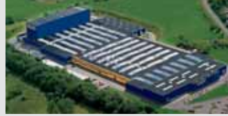
Hörmann KG Freisen