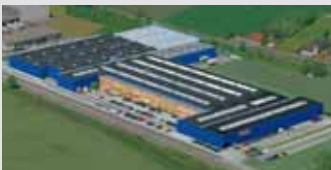
Hörmann KG Werne