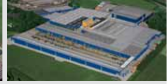
Hörmann KG Brockhagen