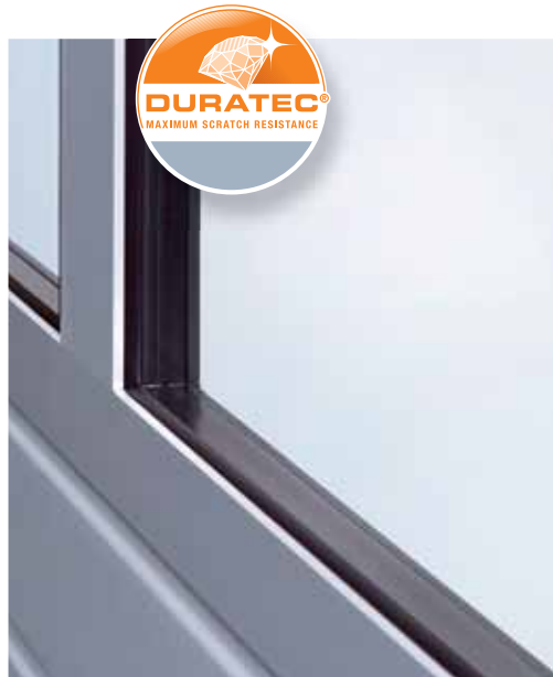
New 26 mm thick glazing