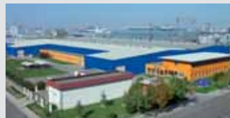
Hörmann Beijing, China