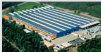
Hörmann Genk NV, Belgium