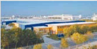
Hörmann Beijing, China