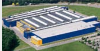
Hörmann KG Eckelhausen, Germany