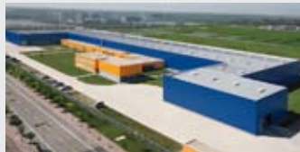
Hörmann Tianjin, China