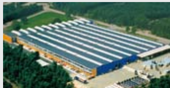
Hörmann Genk NV, Belgium