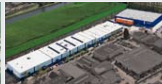
Hörmann Alkmaar B.V., Netherlands