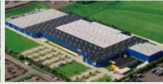
Hörmann KG Brandis, Germany