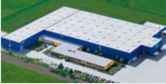
Hörmann KG Dissen, Germany