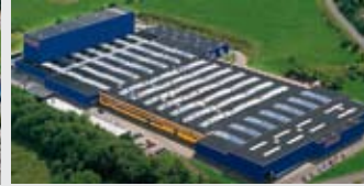
Hörmann KG Freisen, Germany