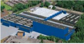
Hörmann KG Amshausen, Germany