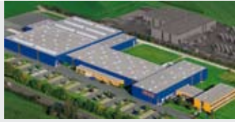
Hörmann KG Antriebstechnik, Germany