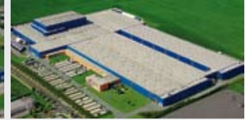
Hörmann KG Ichtershausen, Germany