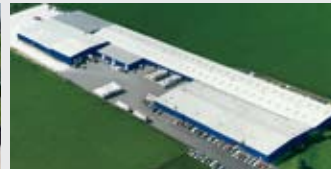
Hörmann LLC, Montgomery IL, USA