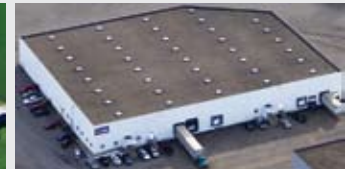
Hörmann Flexon, Leetsdale PA, USA

Hörmann is the only manufacturer worldwide that offers you a complete range of all major building products from one source. We manufacture in highly-specialised factories using the latest production technologies. The close-meshed network of sales and service companies throughout Europe, and activities in the USA and China, make Hörmann your strong partner for first-class building products, offering “Quality without Compromise”.