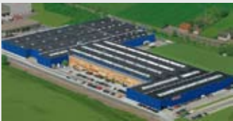
Hörmann KG Werne, Germany