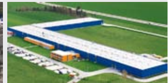
Hörmann Legnica Sp. z o.o., Poland