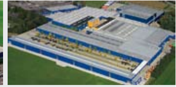
Hörmann KG Brockhagen, Germany